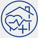
MDHS Student Hub

If you have joined the program but feel that you are no longer able to continue your commitment, please let us know us as soon as possible.